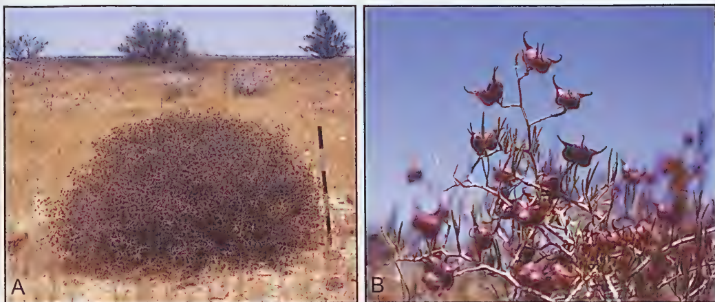
Figure 3. Dodonaea amplisemina (J.G. West 3324–3327 CANB, PERTH) growing on quartzite hills near Cue. A – dome-shaped habit; B – fruits with three horn-like appendages. Note collections from this area have linear leaves only, rather than linear and narrowly obovate leaves but the seeds are typical of ironstone populations of D. amplisemina .

Etymology. From the Latin amplus (large) and semen (seed), as this species can be distinguished from its closest relatives by its large, shiny seeds.